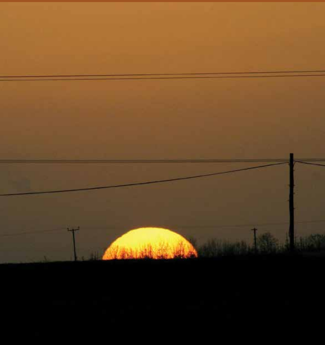
Winter Sunset near Barningham