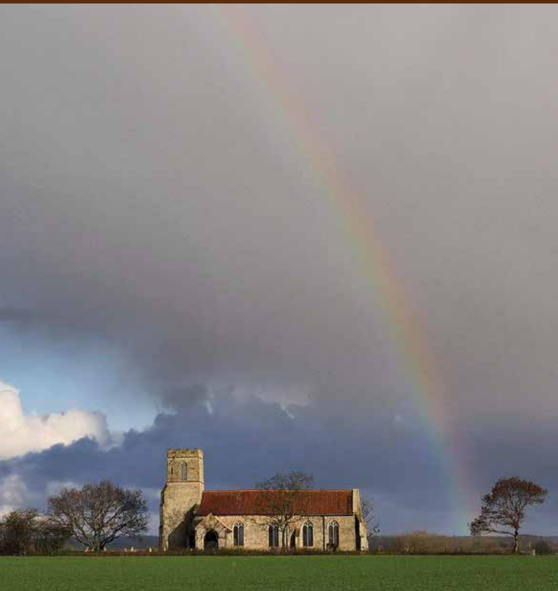
Corpusty Church