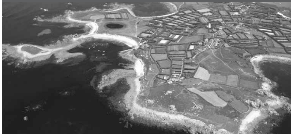
St Agnes