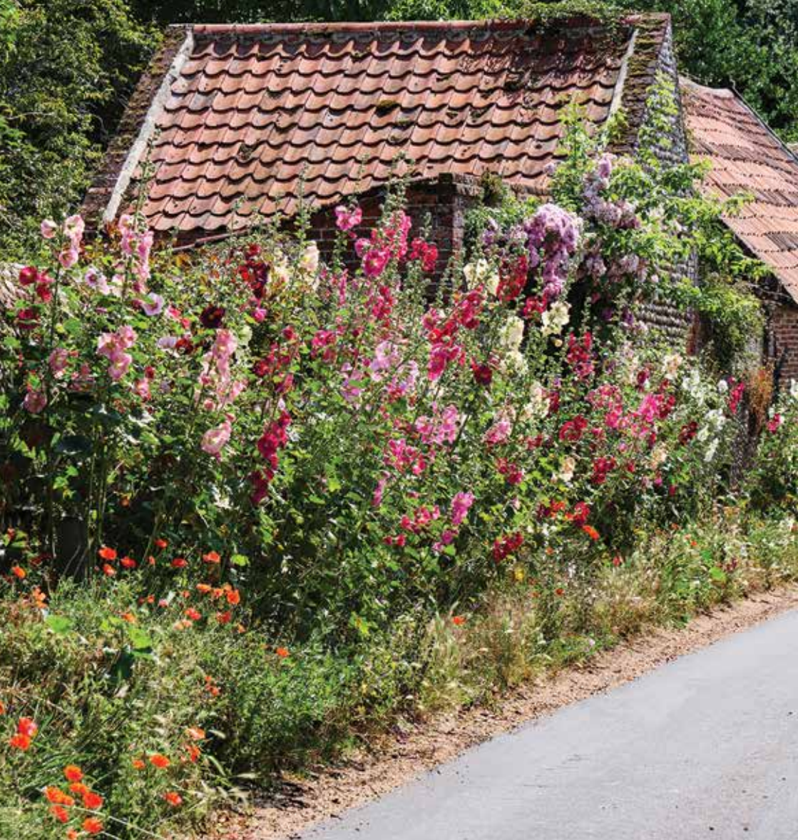
Plumstead Hollyhocks