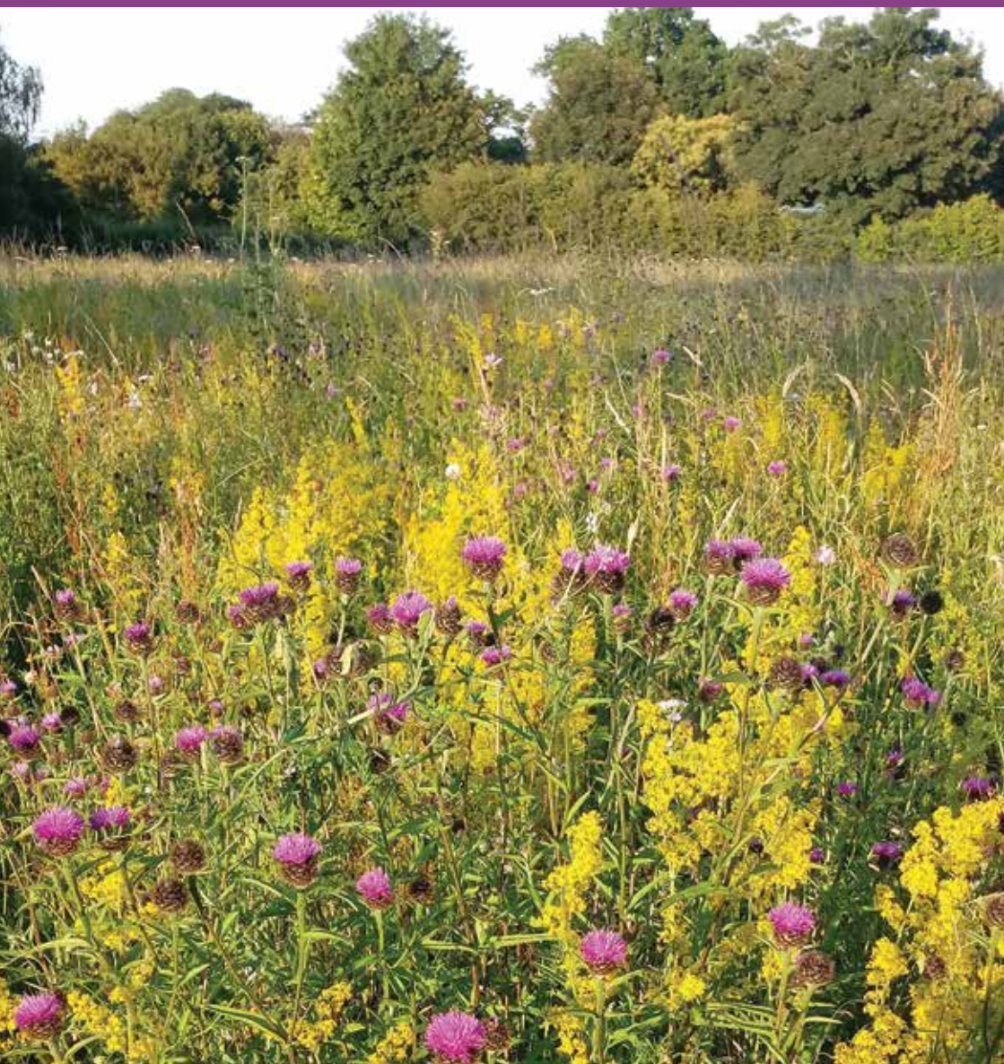
Plumstead Wildflower Meadow