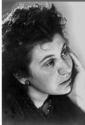
Etty Hillesum (1914 – c1943)