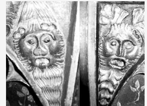
Green lion and green man from St Andrew Saxthorpe's rood screen

The January LinC talk in Corpusty Village Hall about 'green men' inspired your correspondent to track down some on the rood screen of St Andrew's Church, Saxthorpe, one of a green man, and one of a green lion. The hunt was successful as the photos bear witness. A 'green man' is a carving in stone, wood or iron where foliage comes out of the mouth, nose, or ears of the animal.