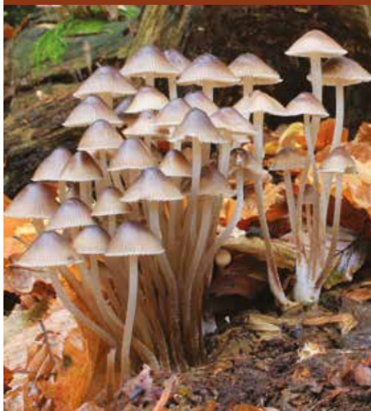
Mycena inclinata, Clustered Bonnet