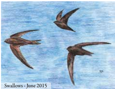
Swallows - June 2015