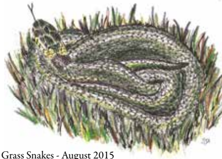
Grass Snakes - August 2015