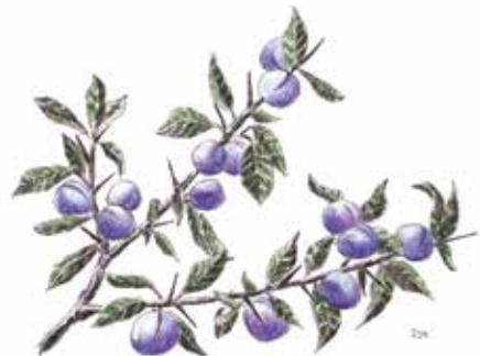
Prunus Spinosa - October 2015

This page is a tribute to our talented natural history correspondent Sue Appleby, who is stepping down because of other commitments. Thank you, Sue, for your fascinating contributions over the years, which were always accompanied by such delightful drawings.