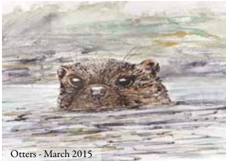
Otters - March 2015