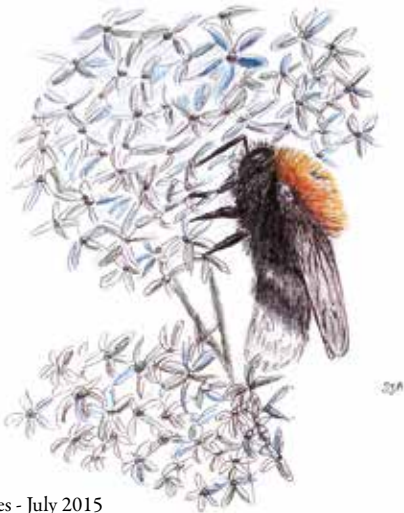
Bees - July 2015