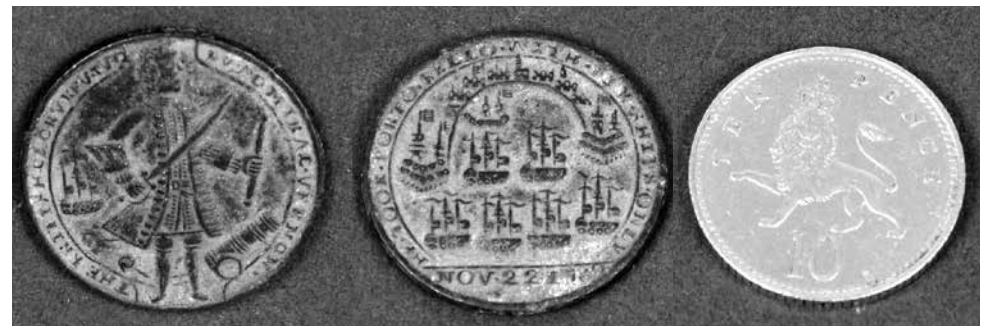
The British glory revived by Admiral Vernon...