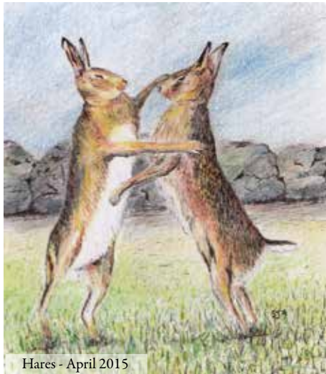
Hares - April 2015