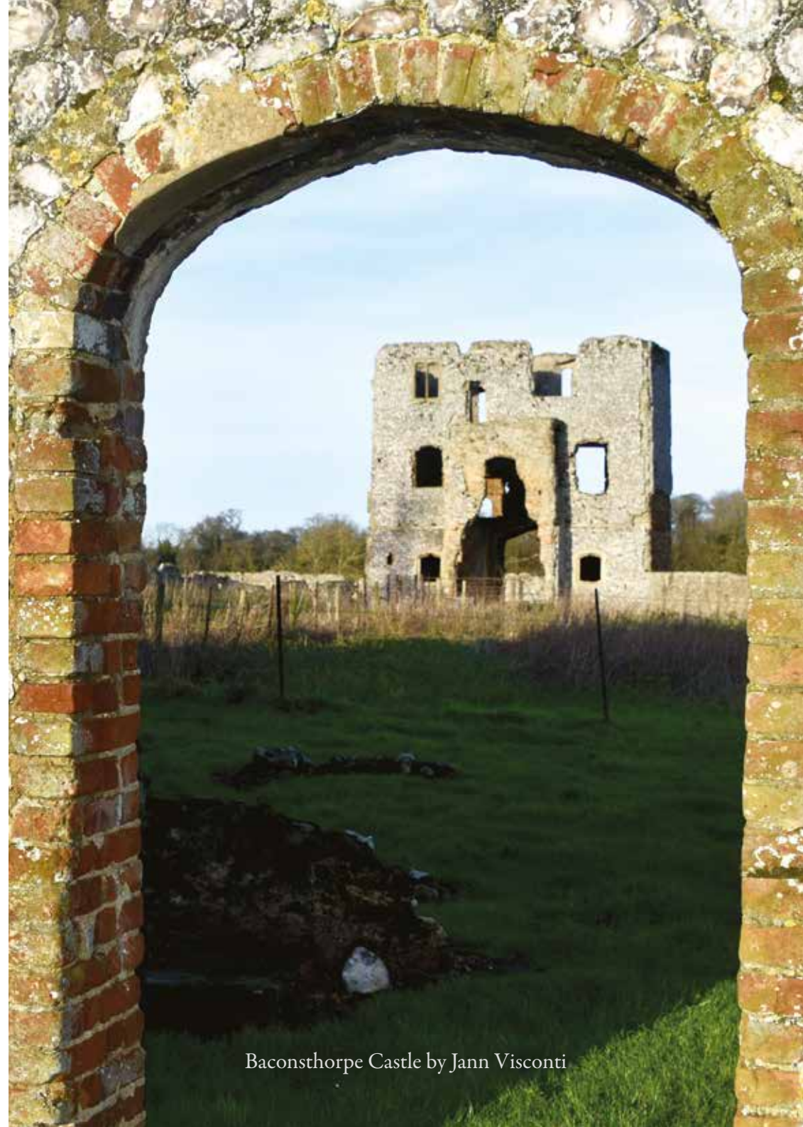
Baconsthorpe Castle by Jann Visconti

https://www.barnardos.org.uk/barnardos_be_safe_guide_print_at_home.pdf