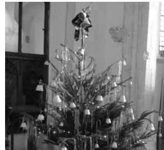
Bell Ringers' Tree 2015