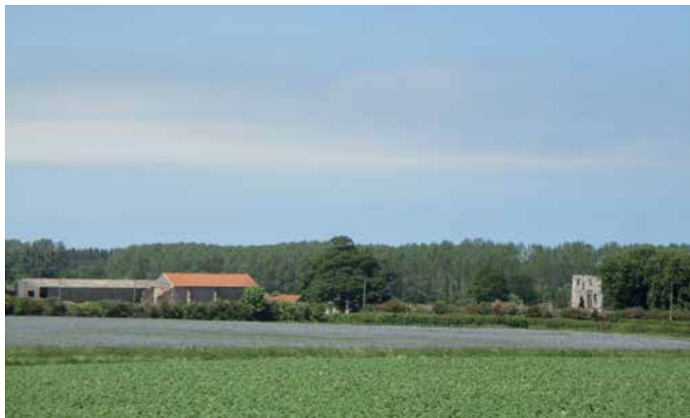
Flax Field at Baconsthorpe Castle