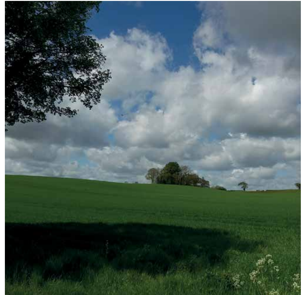
Saxthorpe Spinney