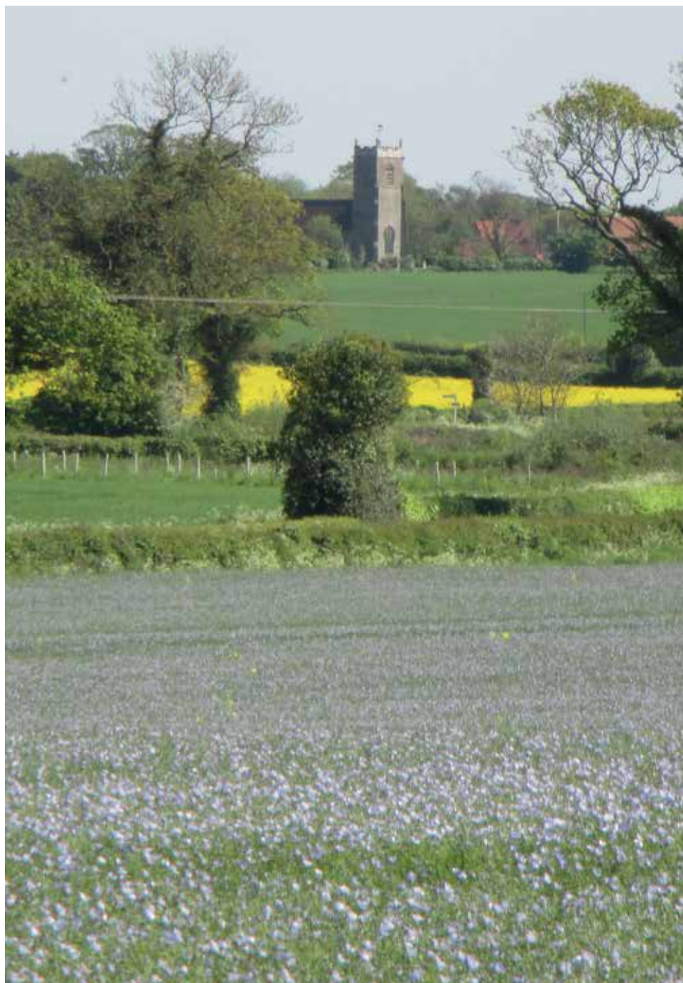
Flax Field and Plumstead Church