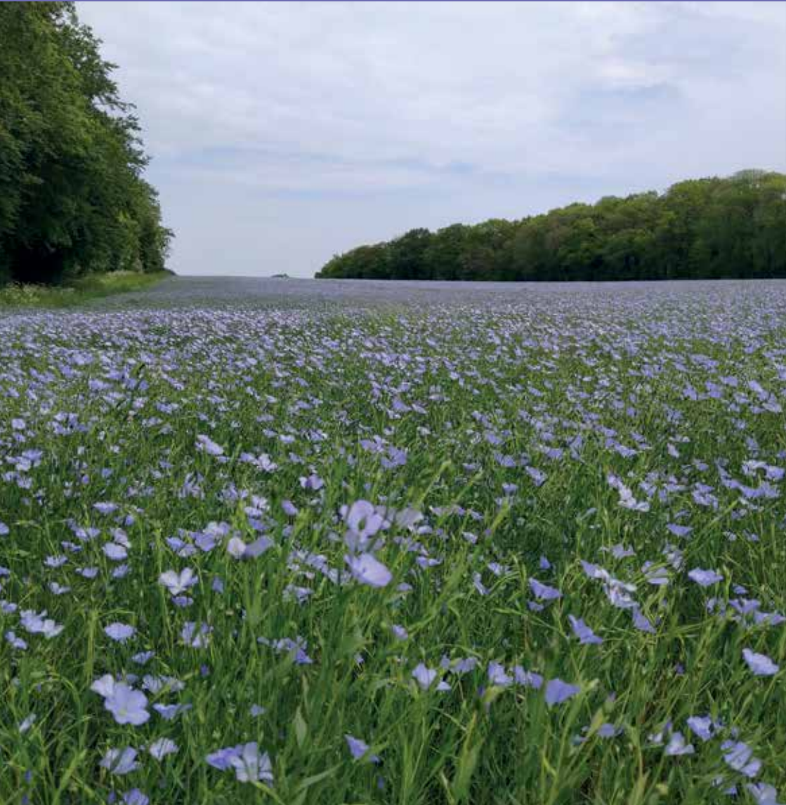
Flax Field — Baconsthorpe