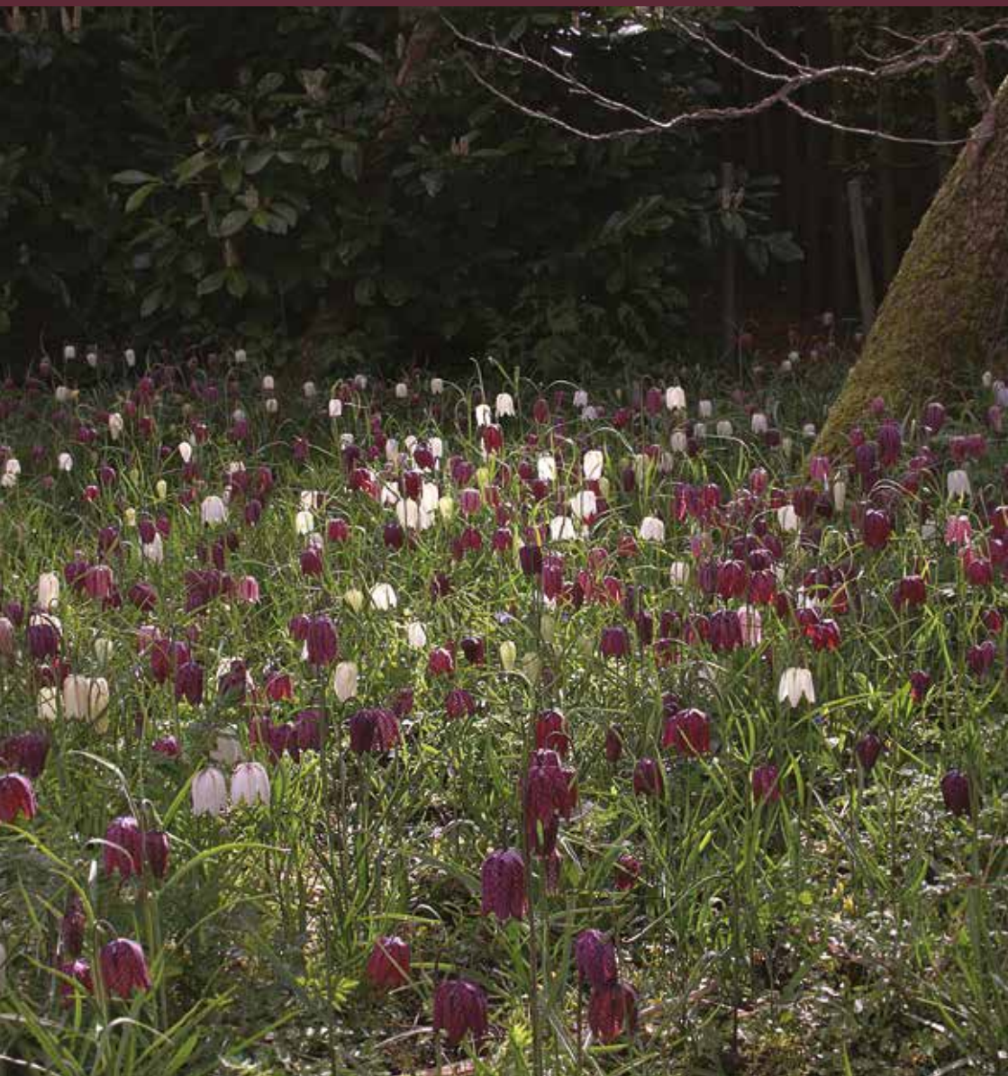
Fritillaries , Corpusty Mill Garden Roger Last