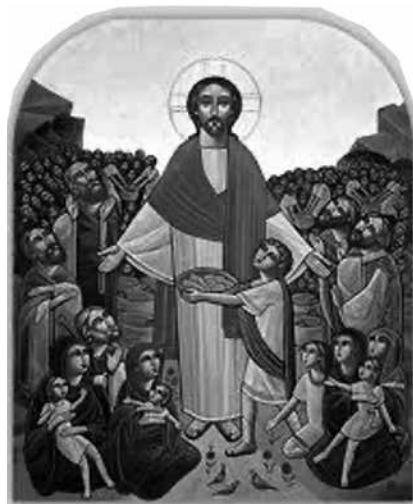
Jesus Feeds The Five Thousand

And the King said: "Come, you that are blessed by my Father, inherit the kingdom prepared for you from the foundation of the world; for I was hungry and you gave me food, I was thirsty and you gave me something to drink, I was a stranger and you welcomed me, I was naked and you gave me clothing, I was sick and you took care of me, I was in prison and you visited me." Then the righteous will answer him, "Lord, when was it that we saw you hungry and gave you food, or thirsty and gave you something to drink? And when was it that we saw you a stranger and welcomed you, or naked and gave you clothing? And when was it that we saw you sick or in prison and visited you?" And the king will answer them, "Truly I tell you, just as you did it to one of the least of these who are members of my family, you did it to me." (Matthew 25.36-40)