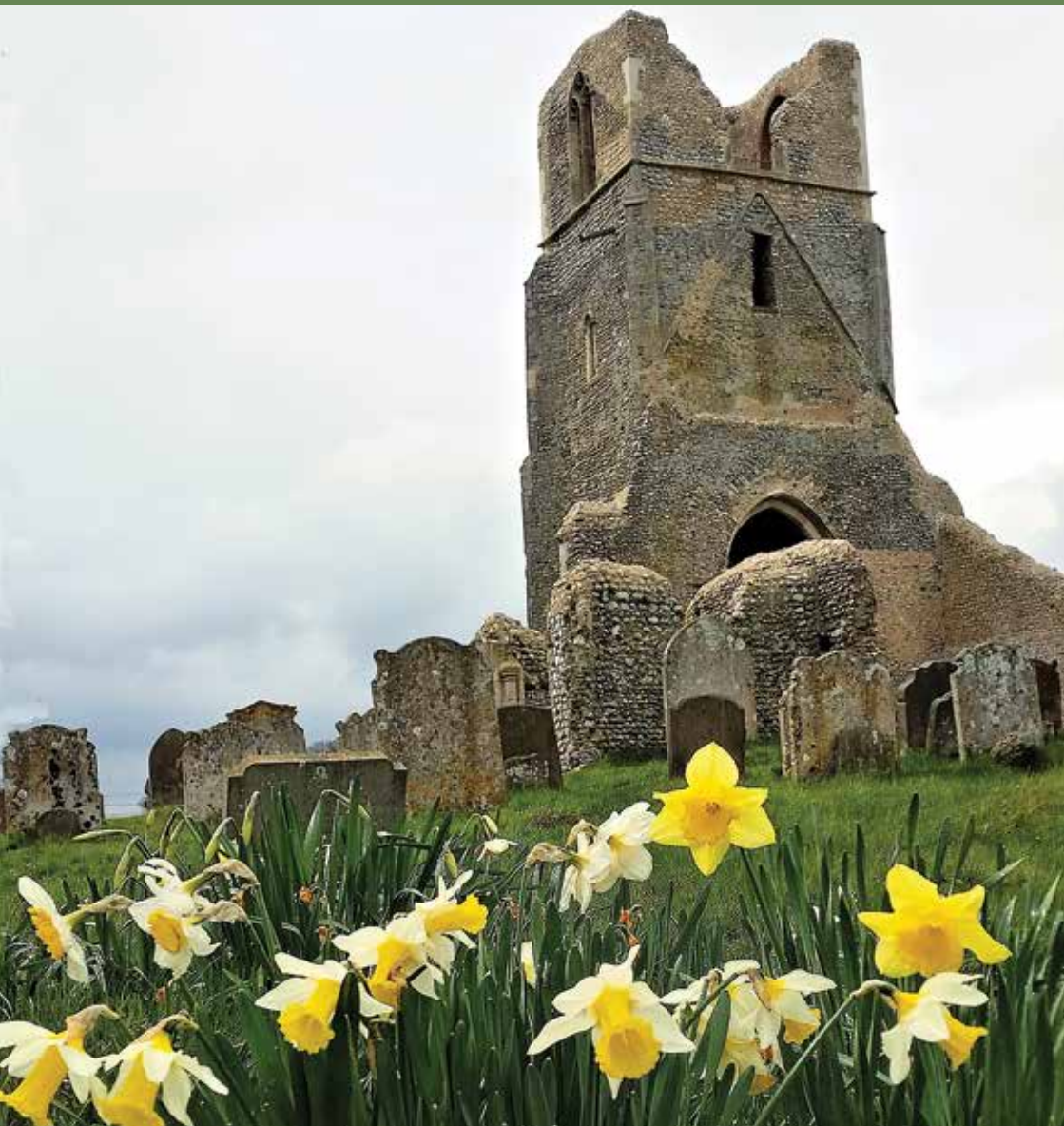
Barningham Winter Church