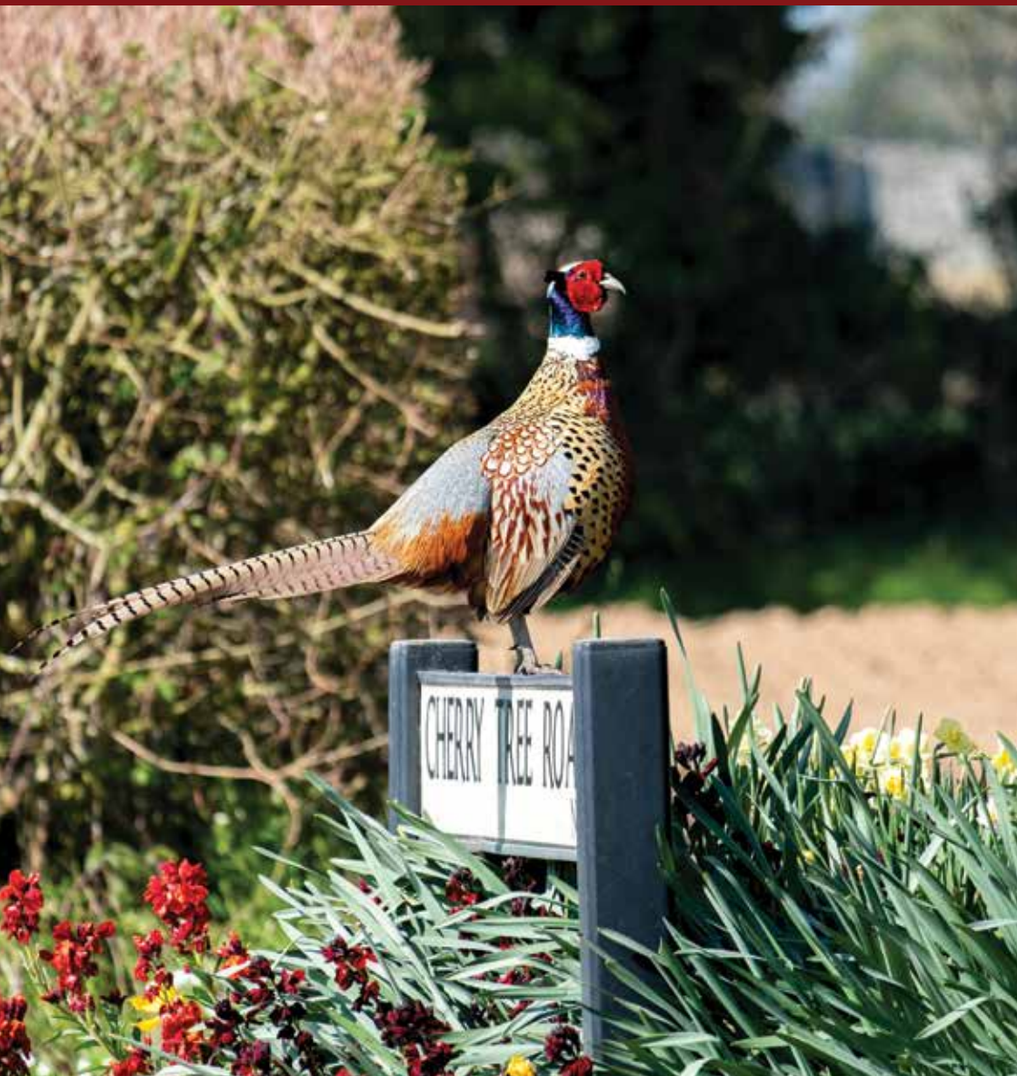
Cherry Tree Road, Plumstead