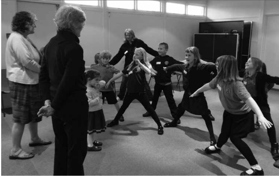
Children Being Broad Beans!

On 20 th April 2017, it was the sixth birthday of Families Together.