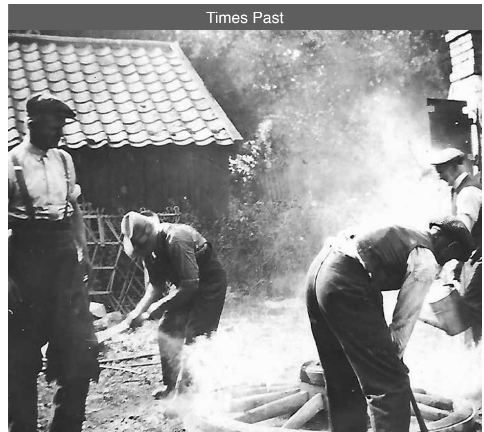
The Wheelwrights at the rear of The Forge, Matlaske