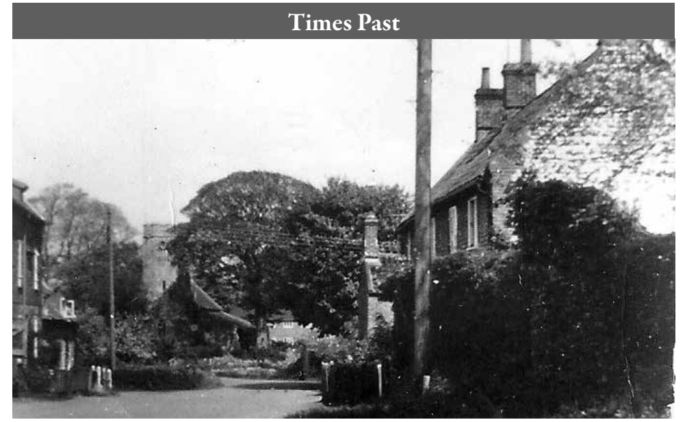
The Street, Matlaske