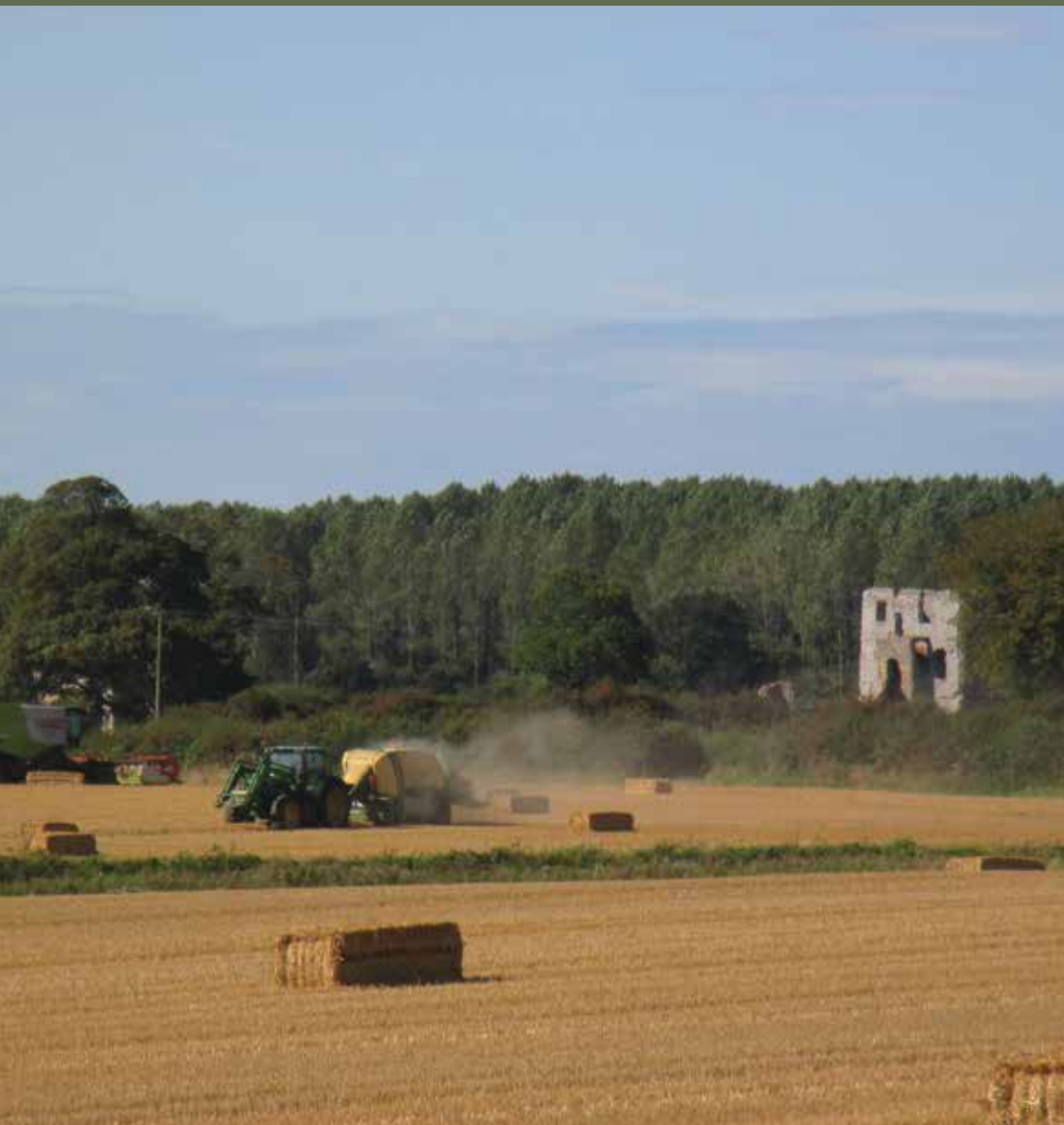
Harvesting at Baconsthorpe Castle