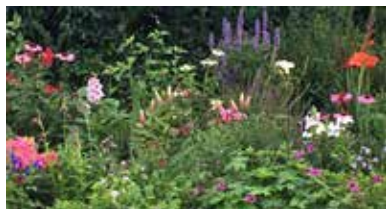
All proceeds to Edgefield Church Assistance dogs only please

Ploughman's lunch and afternoon tea Plant and book stalls. Raffle