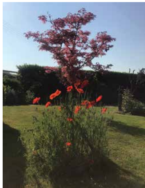
Plumstead Morning by Brian Monks