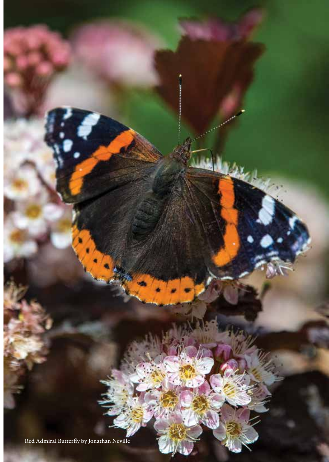
Red Admiral Butterfly

were demolished in the early sixties, their location still shown by a gap in the hedge there. Finally, more recently, a cluster of five terraced houses in The Street was reduced to four when the end one was knocked down, perhaps for vehicular access. All interesting stuff from a bygone age!