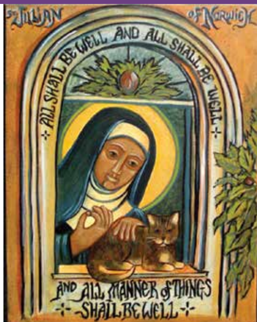
Julian of Norwich