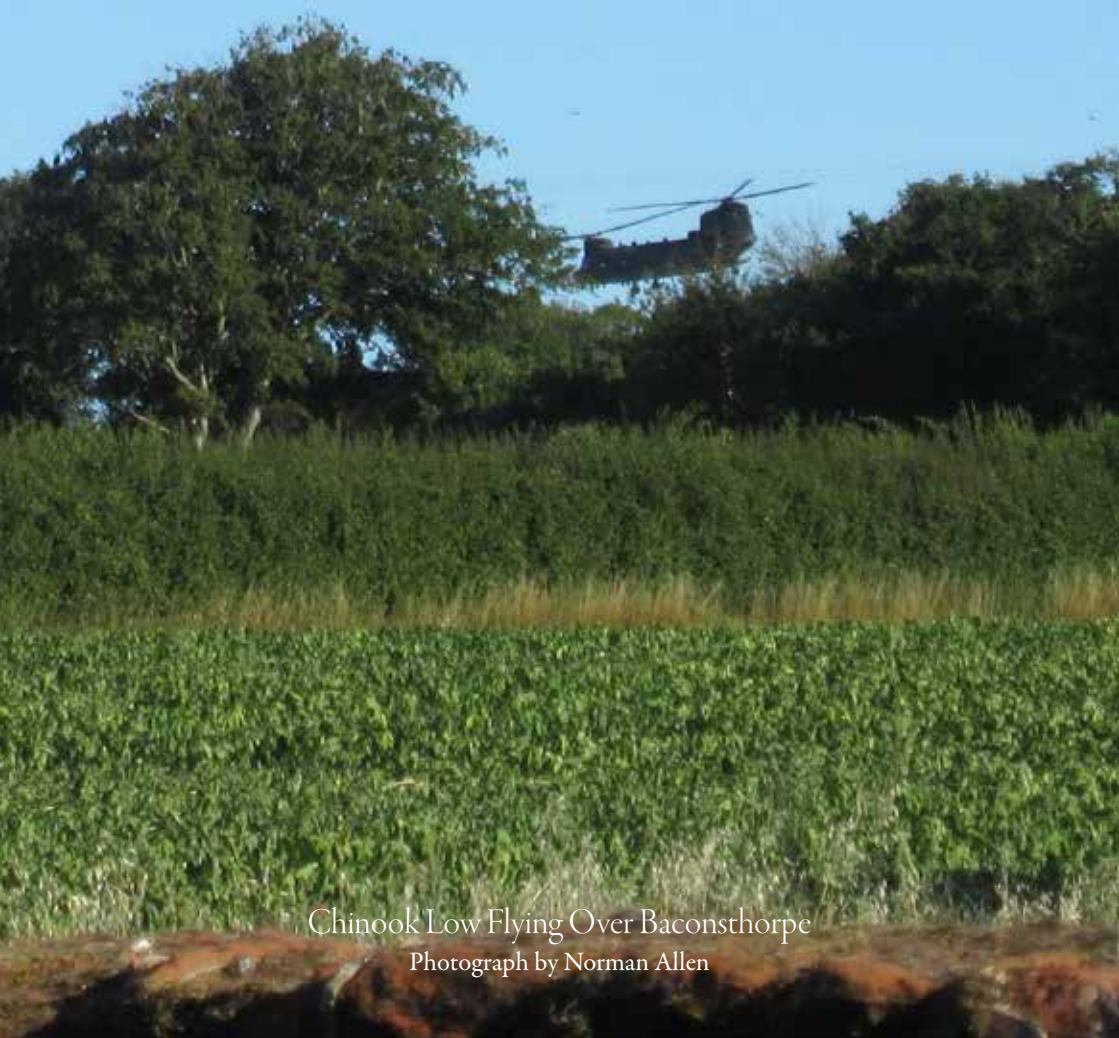
Chinook Low Flying Over Baconsthorpe