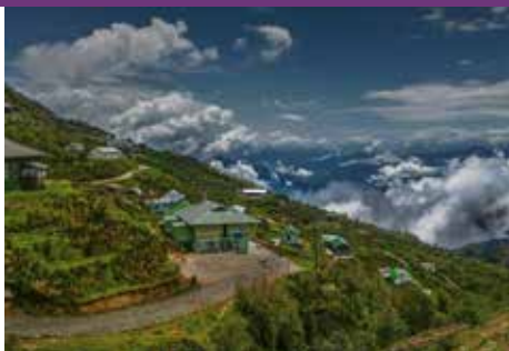
Nagaland, North East India

I have been deeply touched by your hospitality, love, and generosity this week - by your rich hearts that have so graciously accepted and blessed me. The vastness of agricultural land here reminds me of my birthplace Manipur in North East India (Nagaland). It is also a rural community: my grandparents were farmers. Farmers in our context are among the poorest. Land is not a luxury but a basic necessity for survival as we depend on agriculture for our livelihood and daily sustenance.