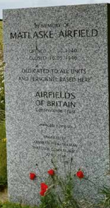
Matlaske Airfield Memorial Stone