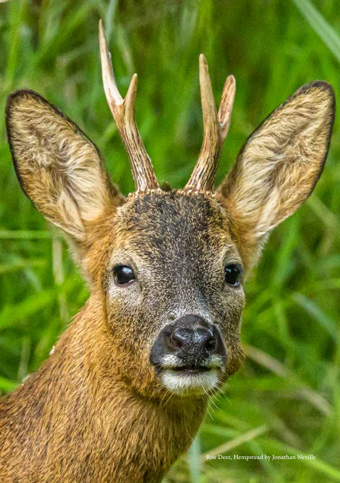
Roe Deer, Hempstead