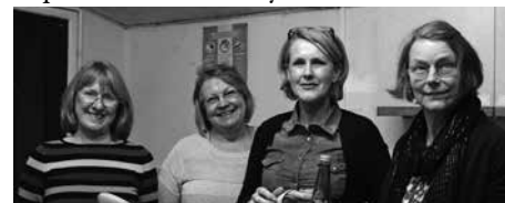
Hempstead's magnificent Afternoon Tea ladies!

Thank you to all involved with the afternoon tea for the visiting Bishop of Lynn, it was a jolly occasion enjoyed by young and old, a special treat; I told my children it's not