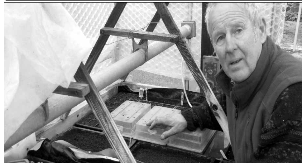
While plants are young and tender keep them moist and protected

I was in my greenhouse last week on a rather cold and bright day but it was warm and cosy inside and the plants were looking happy and growing well. There are a few important points to follow if you want success in your greenhouse. Plants need light, moisture, warmth, food, air and a nice clean home, rather like ourselves.