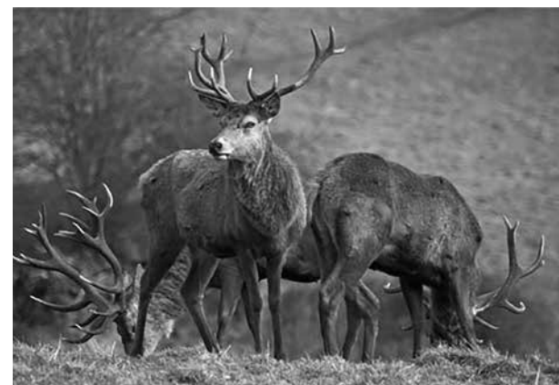
British Red Deer