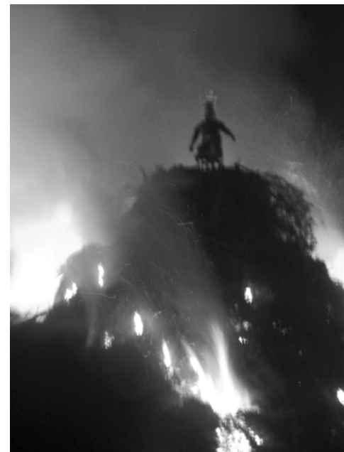
Corpusty Bonfire Night