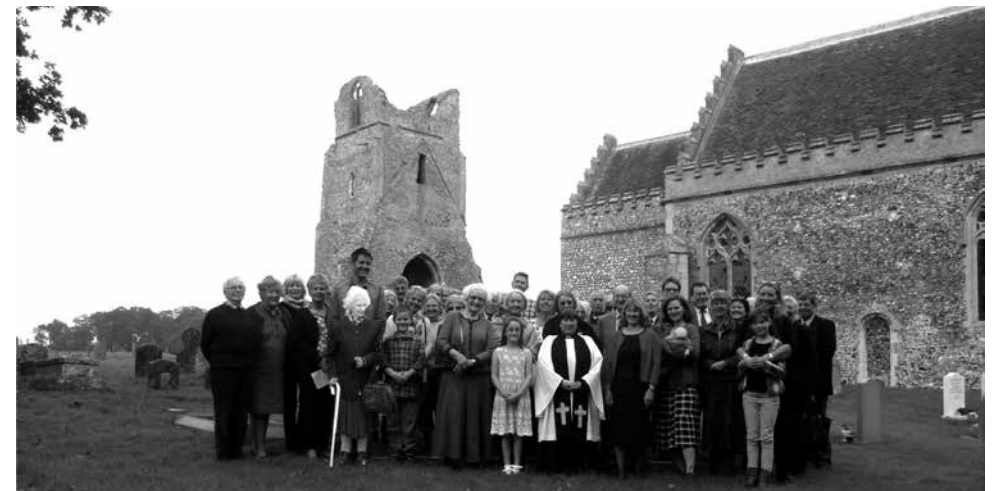
Barningham Winter Harvest Festival Congregation