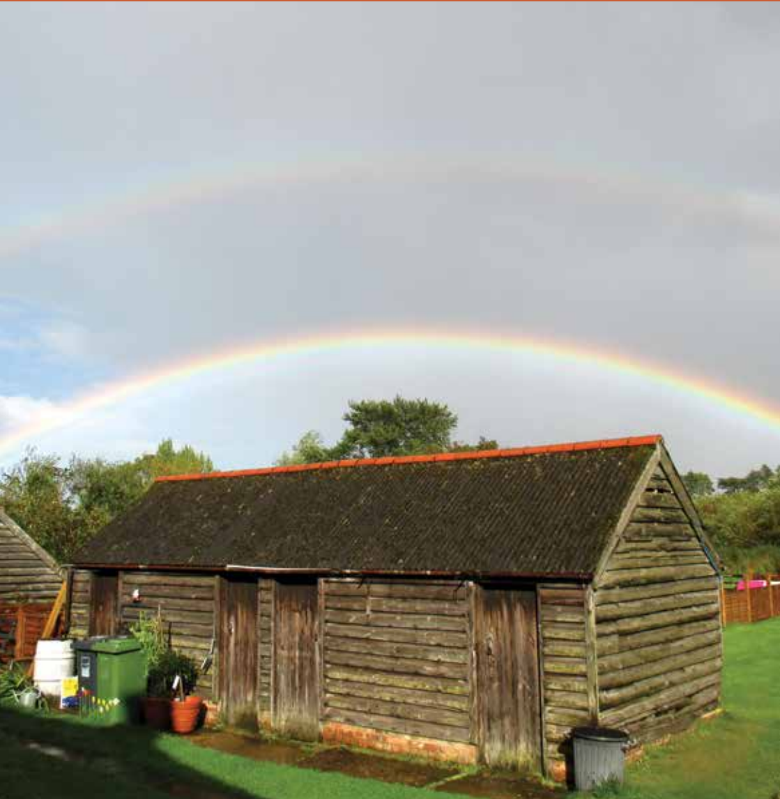
Double Rainbow over Baconsthorpe