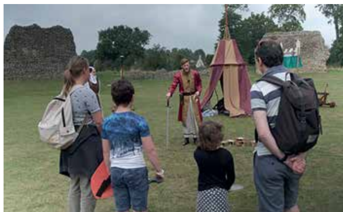
Escape Games Company