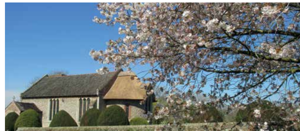
Cherry Blossom at Hempstead Church