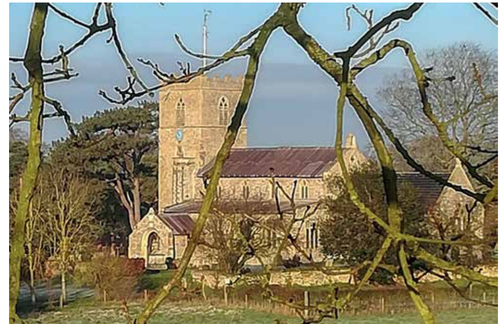
Saxthorpe Church

The PC has purchased litter-picking paraphernalia, which is planned to be put to good use shortly. You will probably have seen that this is very necessary, particularly on some of the approaches to our villages. As it is likely that a socially distanced litter-pick will take place, on a date to be arranged, before the April edition of the newsletter appears, please keep an eye on the village notice board if you would like to take part, as the date will be posted there.