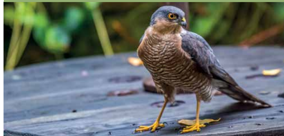
Sparrow Hawk