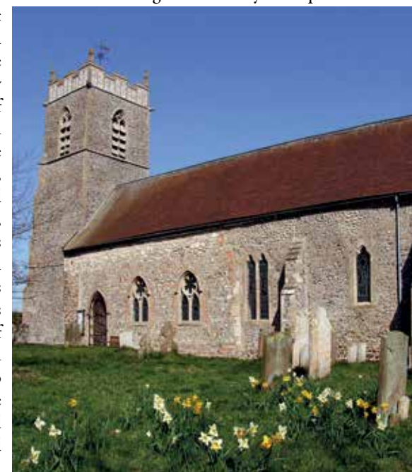
St Michael's Church