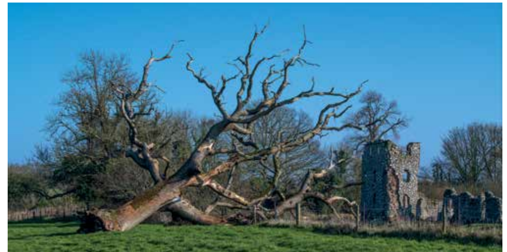
Baconsthorpe Castle