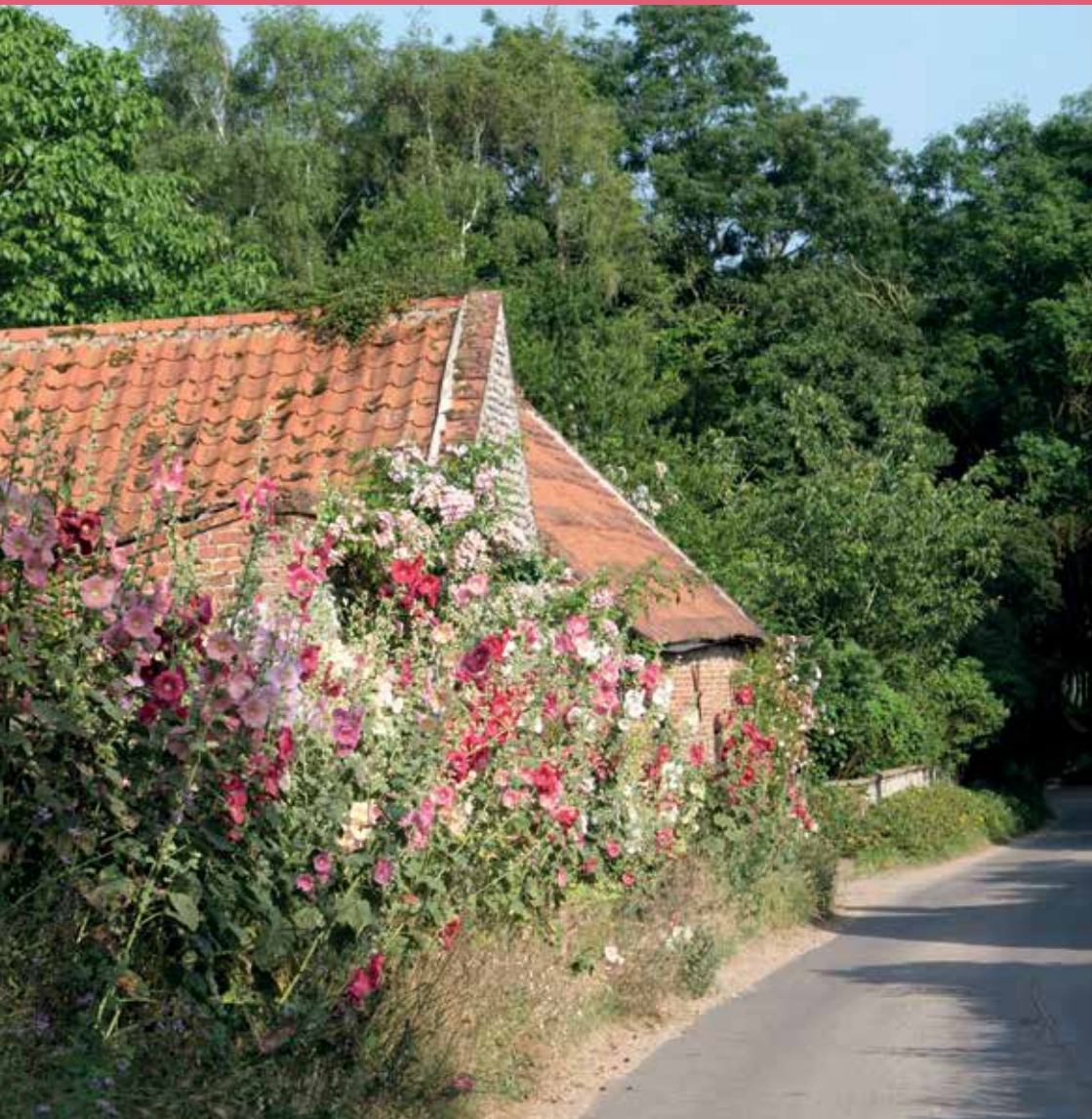
Plumstead Hollyhocks