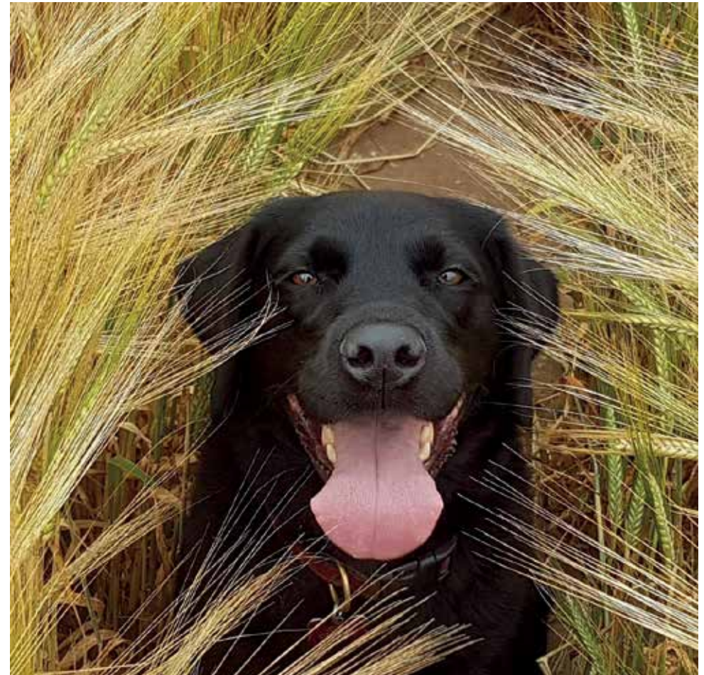
Louis playing hide and seek in a barley field