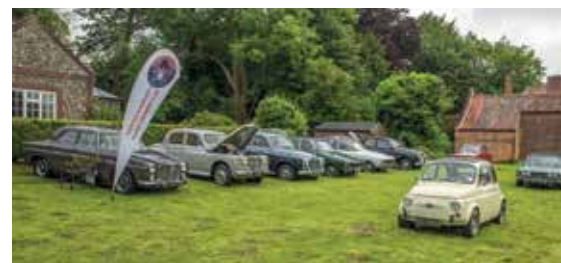
Classic Rovers and a Classic Fiat

The classic cars, about 30 in all, provided yet another interest, as did the carvings, sculptures, moths, textiles, jewellery, plants and dogs agility course. To our knowledge amongst a wealth of positive comment and appreciation we have had only two complaints, there were not enough dog poo bins (we welcomed dogs) and the queue for lunch. We will learn for another time!