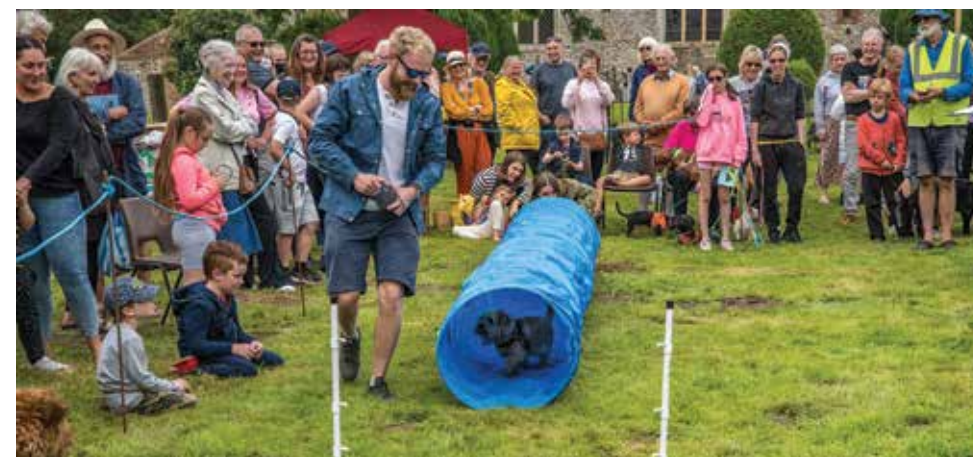
Hempstead Fête & Dog Show