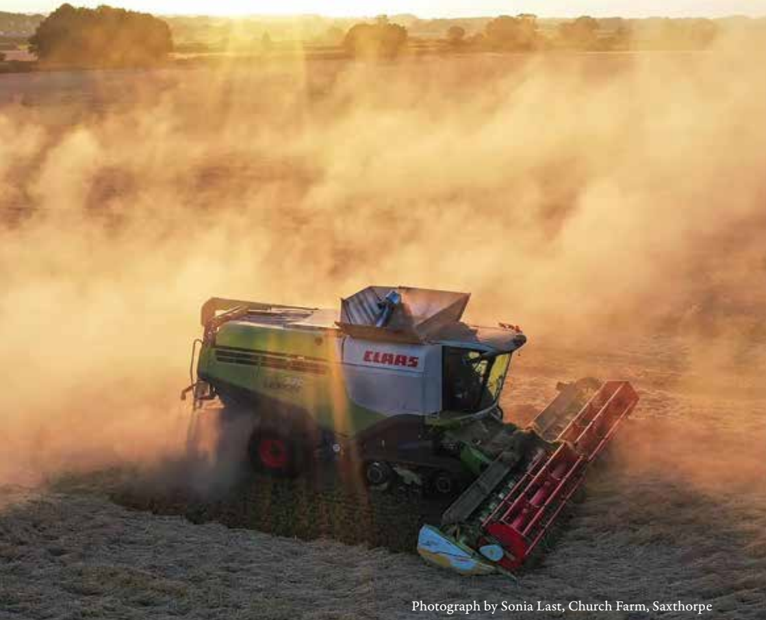
Church Farm, Saxthorpe