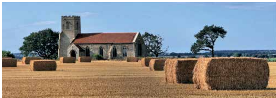
St Peter's Church