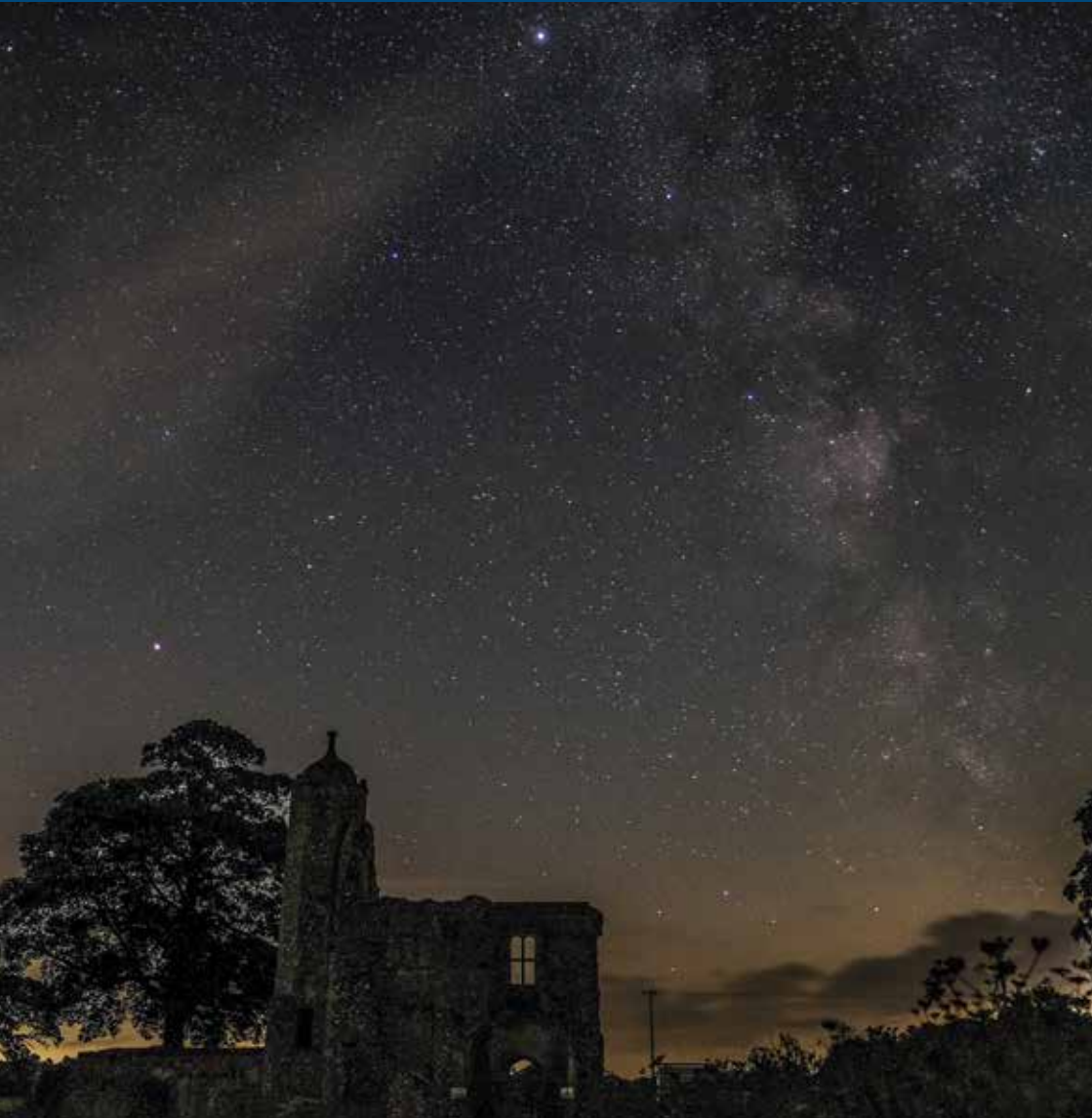
Night Sky over Baconsthorpe Castle